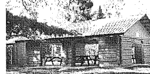
Heritage Park and Campground Showers, Trails, Fitness Course 218/984-2084