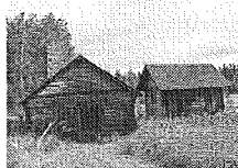
Homestead Tours Memorial Day-Labor Day 218/984-2084

The mission of Sisu Heritage, Inc. is to enhance the Embarrass region by preserving and sharing its unique culture, climate and history.